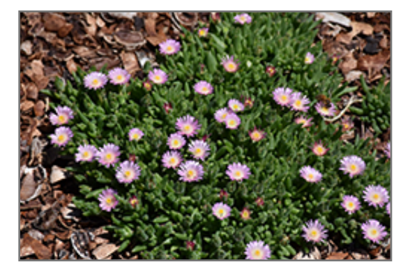
Jewel Of Desert Rosequartz Ice Plant in bloom