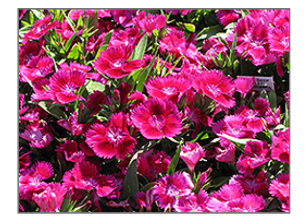
Ideal Deep Violet Pinks flowers