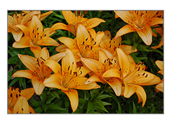
Sans Rafael Lily flowers