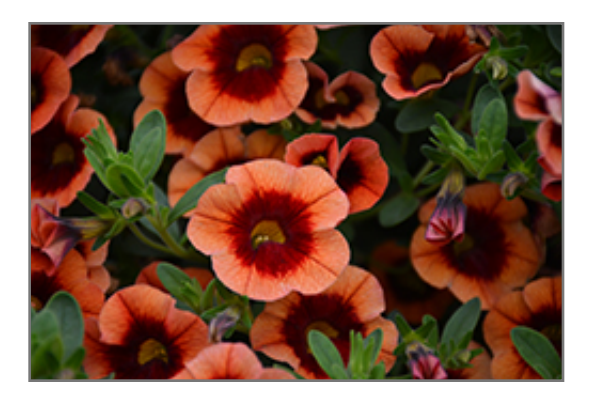
Superbells Tangerine Punch Calibrachoa flowers

Superbells Tangerine Punch Calibrachoa is a dense herbaceous annual with a trailing habit of growth, eventually spilling over the edges of hanging baskets and containers. Its medium texture blends into the garden, but can always be balanced by a couple of finer or coarser plants for an effective composition.