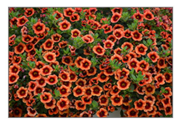
Superbells Tangerine Punch Calibrachoa flowers