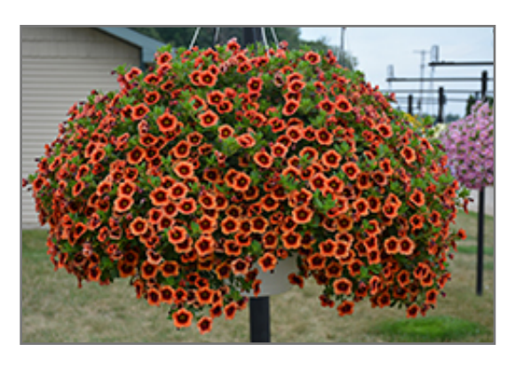
Superbells Tangerine Punch Calibrachoa in bloom