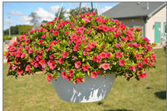
Superbells Tabletop Red Calibrachoa in bloom