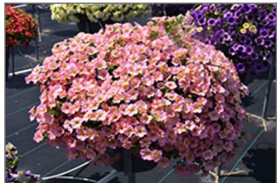
Superbells Honeyberry Calibrachoa in bloom