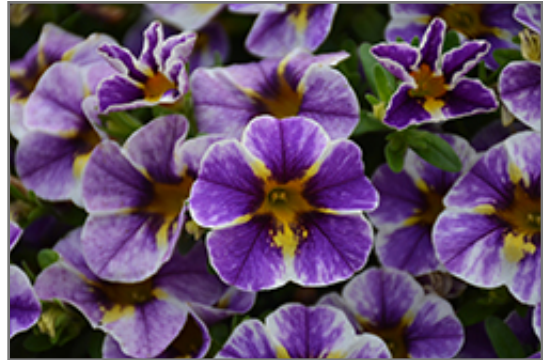
Superbells Holy Smokes! Calibrachoa flowers

Superbells Holy Smokes! Calibrachoa is a dense herbaceous annual with a trailing habit of growth, eventually spilling over the edges of hanging baskets and containers. Its medium texture blends into the garden, but can always be balanced by a couple of finer or coarser plants for an effective composition.