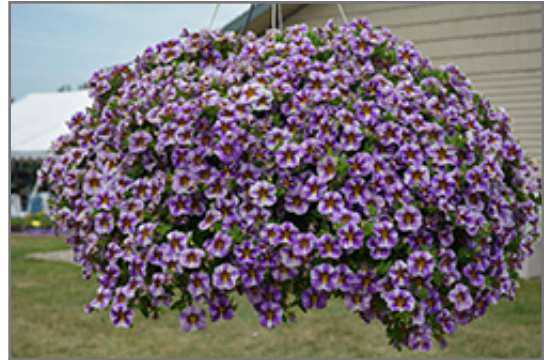
Superbells Holy Smokes! Calibrachoa in bloom