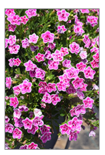
Superbells Doublette Love Swept Calibrachoa flowers

Superbells Doublette Love Swept Calibrachoa is a fine choice for the garden, but it is also a good selection for planting in outdoor containers and hanging baskets. Because of its trailing habit of growth, it is ideally suited for use as a 'spiller' in the 'spiller-thriller-filler' container combination; plant it near the edges where it can spill gracefully over the pot. Note that when growing plants in outdoor containers and baskets, they may require more frequent waterings than they would in the yard or garden.