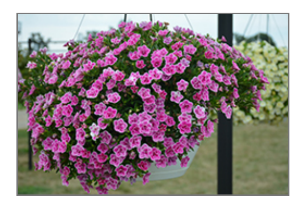
Superbells Doublette Love Swept Calibrachoa in bloom