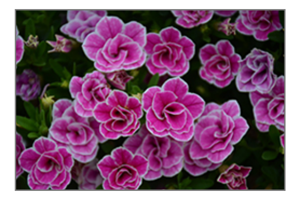
Superbells Doublette Love Swept Calibrachoa flowers

Superbells Doublette Love Swept Calibrachoa is a dense herbaceous annual with a trailing habit of growth, eventually spilling over the edges of hanging baskets and containers. Its medium texture blends into the garden, but can always be balanced by a couple of finer or coarser plants for an effective composition.