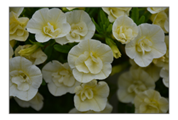
Superbells Double Chiffon Calibrachoa flowers