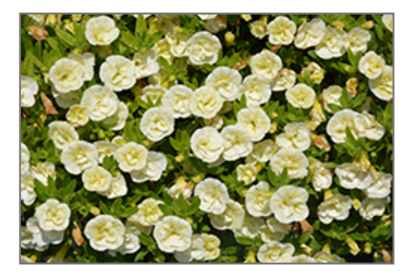
Superbells Double Chiffon Calibrachoa flowers

Superbells Double Chiffon Calibrachoa is a dense herbaceous annual with a trailing habit of growth, eventually spilling over the edges of hanging baskets and containers. Its medium texture blends into the garden, but can always be balanced by a couple of finer or coarser plants for an effective composition.