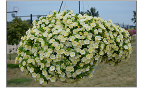
Superbells Double Chiffon Calibrachoa in bloom

Superbells Double Chiffon Calibrachoa will grow to be about 10 inches tall at maturity, with a spread of 24 inches. When grown in masses or used as a bedding plant, individual plants should be spaced approximately 12 inches apart. Its foliage tends to remain low and dense right to the ground. This fast-growing annual will normally live for one full growing season, needing replacement the following year.