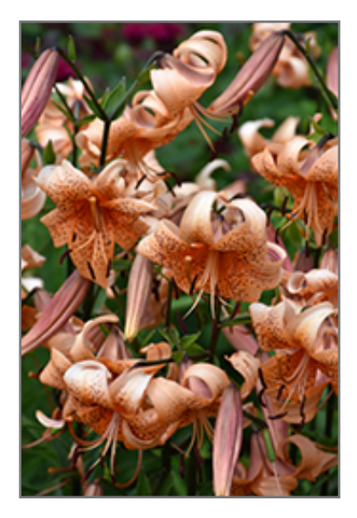
Sally Lily flowers

Sally Lily features bold gold trumpet-shaped flowers with orange overtones at the ends of the stems in early summer. The flowers are excellent for cutting. Its narrow leaves remain green in colour throughout the season.