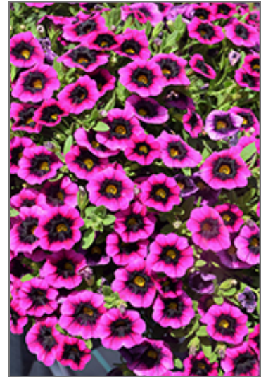
Superbells Blackcurrent Punch Calibrachoa flowers

This plant will require occasional maintenance and upkeep. Trim off the flower heads after they fade and die to encourage more blooms late into the season. It is a good choice for attracting bees and hummingbirds to your yard, but is not particularly attractive to deer who tend to leave it alone in favor of tastier treats. It has no significant negative characteristics.