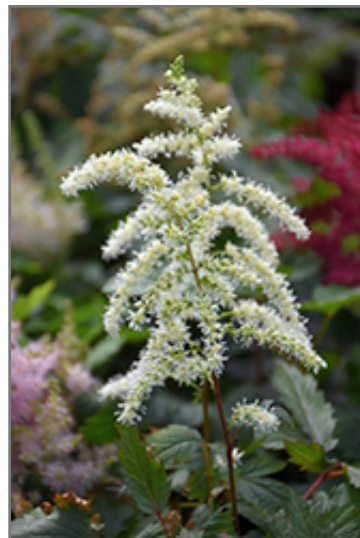
Cappuccino Astilbe flowers