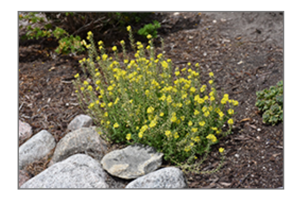
Mountain Gold Alyssum in bloom

Mountain Gold Alyssum is recommended for the following landscape applications;