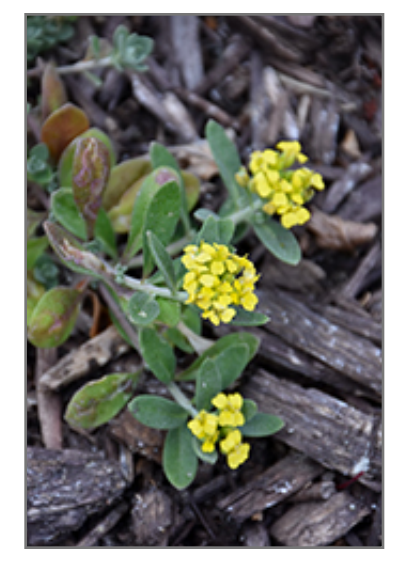
Mountain Gold Alyssum flowers

This is a relatively low maintenance plant, and should be cut back in late fall in preparation for winter. It is a good choice for attracting bees and butterflies to your yard, but is not particularly attractive to deer who tend to leave it alone in favor of tastier treats. It has no significant negative characteristics.