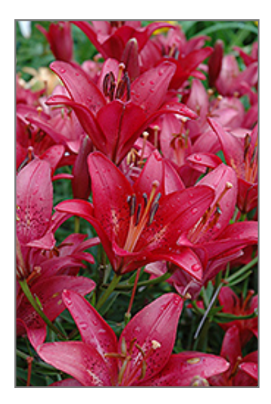
Royal Paradise Lily flowers

Royal Paradise Lily features bold cherry red trumpet-shaped flowers with fuchsia overtones and dark red spots at the ends of the stems in mid summer. The flowers are excellent for cutting. Its narrow leaves remain green in colour throughout the season.