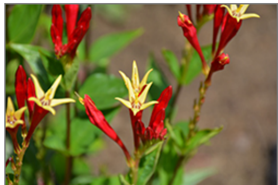
Little Redhead Indian Pink flowers