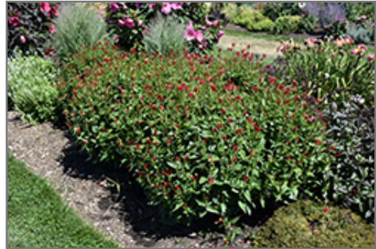
Little Redhead Indian Pink in bloom