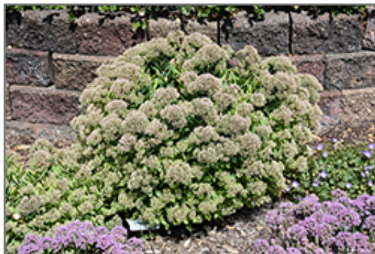
Powderpuff Stonecrop in bloom

Powderpuff Stonecrop is a fine choice for the garden, but it is also a good selection for planting in outdoor pots and containers. It is often used as a 'filler' in the 'spiller-thriller-filler' container combination, providing a mass of flowers and foliage against which the thriller plants stand out. Note that when growing plants in outdoor containers and baskets, they may require more frequent waterings than they would in the yard or garden. Be aware that in our climate, most plants cannot be expected to survive the winter if left in containers outdoors, and this plant is no exception. Contact our experts for more information on how to protect it over the winter months.