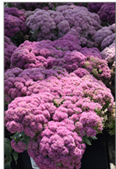
Powderpuff Stonecrop flowers