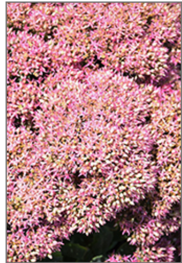
Powderpuff Stonecrop flowers

This is a relatively low maintenance plant, and is best cleaned up in early spring before it resumes active growth for the season. It is a good choice for attracting bees and butterflies to your yard, but is not particularly attractive to deer who tend to leave it alone in favor of tastier treats. It has no significant negative characteristics.