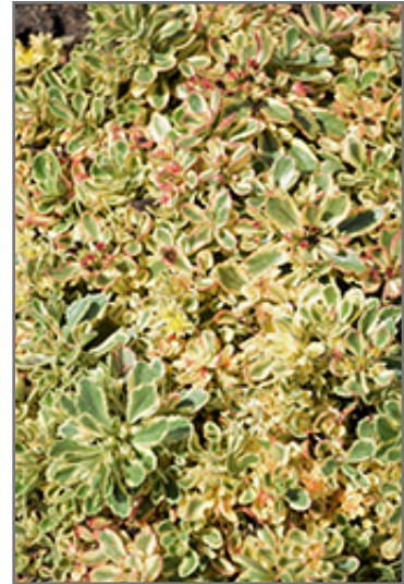
Rock 'N Low Boogie Woogie Stonecrop foliage

Rock 'N Low Boogie Woogie Stonecrop is a fine choice for the garden, but it is also a good selection for planting in outdoor pots and containers. It is often used as a 'filler' in the 'spiller-thriller-filler' container combination, providing a mass of flowers and foliage against which the thriller plants stand out. Note that when growing plants in outdoor containers and baskets, they may require more frequent waterings than they would in the yard or garden. Be aware that in our climate, most plants cannot be expected to survive the winter if left in containers outdoors, and this plant is no exception. Contact our experts for more information on how to protect it over the winter months.