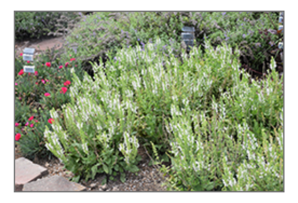
White Profusion Meadow Sage in bloom