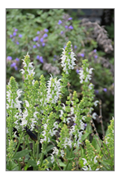
White Profusion Meadow Sage flowers

This is a relatively low maintenance plant, and is best cleaned up in early spring before it resumes active growth for the season. It is a good choice for attracting bees, butterflies and hummingbirds to your yard, but is not particularly attractive to deer who tend to leave it alone in favor of tastier treats. It has no significant negative characteristics.