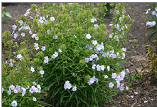
Fashionably Early Lavender Ice Garden Phlox flowers