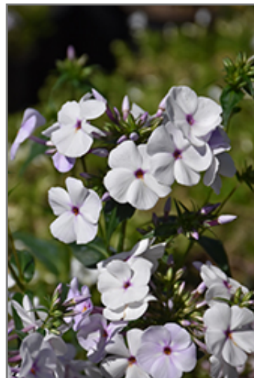
Fashionably Early Lavender Ice Garden Phlox flowers