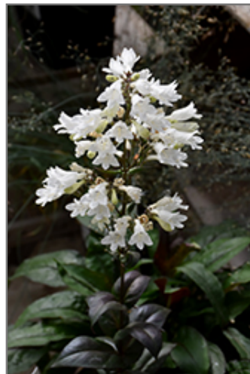
Onyx and Pearls Beard Tongue flowers