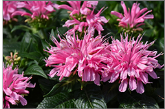
Electric Neon Pink Beebalm flowers