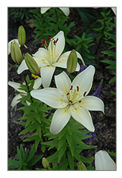
Roma Lily flowers

Roma Lily features bold creamy white trumpet-shaped flowers with light green throats and brown spots at the ends of the stems in early summer. The flowers are excellent for cutting. Its narrow leaves remain green in colour throughout the season.