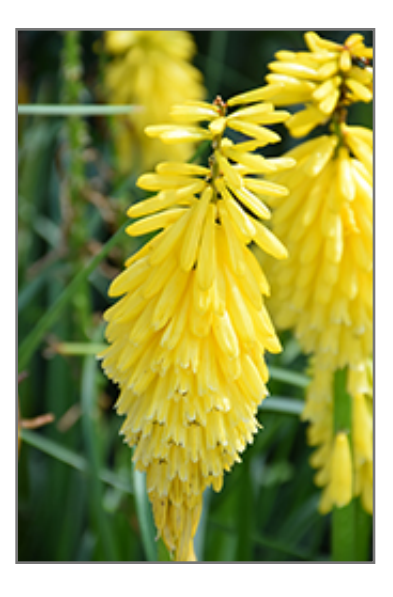
Pyromania Solar Flare Torchlily flowers

An excellent, compact, re-blooming variety with an upright habit and sunny bright yellow flower stalks, creating an outstanding border or container planting; makes a great cutflower and attracts hummingbirds