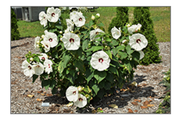
Old Yella Hibiscus in bloom

This plant will require occasional maintenance and upkeep, and should be cut back in late fall in preparation for winter. It is a good choice for attracting butterflies and hummingbirds to your yard. Gardeners should be aware of the following characteristic(s) that may warrant special consideration;