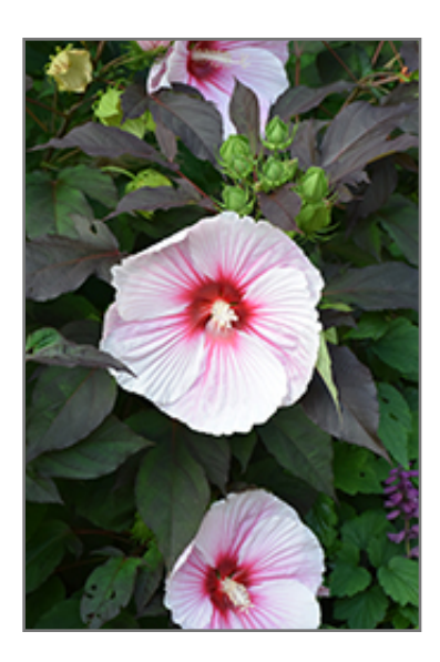
Dark Mystery Hibiscus flowers