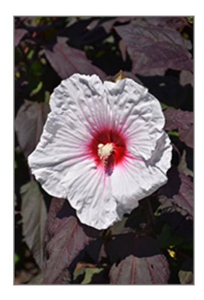
Dark Mystery Hibiscus flowers