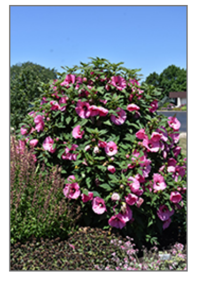
Summerific Candy Crush Hibiscus in bloom