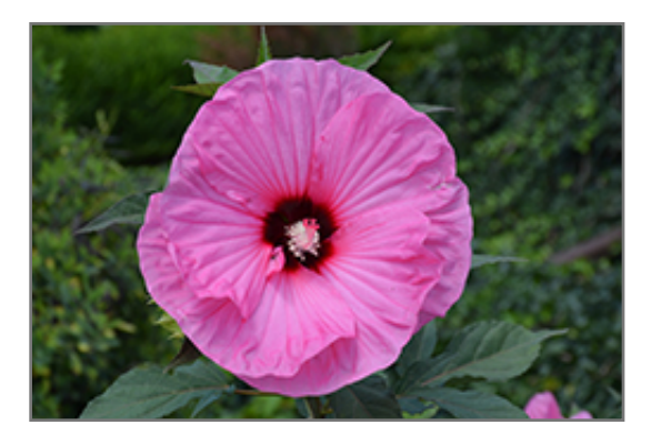
Summerific Candy Crush Hibiscus flowers

This plant will require occasional maintenance and upkeep, and should be cut back in late fall in preparation for winter. It is a good choice for attracting butterflies and hummingbirds to your yard. Gardeners should be aware of the following characteristic(s) that may warrant special consideration;