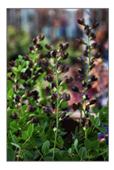
Decadence Dark Chocolate False Indigo flowers