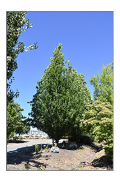
Skinny Genes Oak