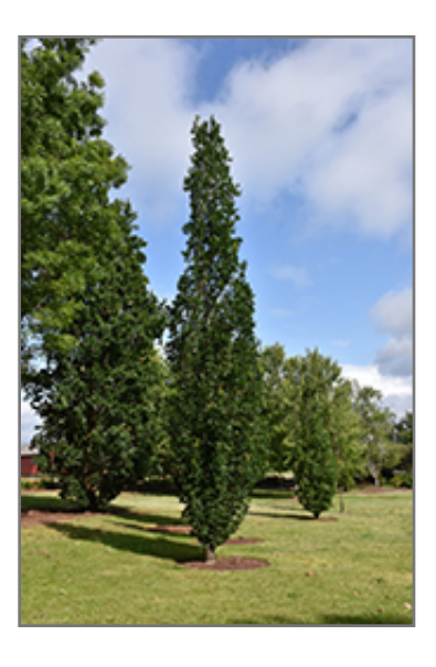
Skinny Genes Oak

Skinny Genes Oak is recommended for the following landscape applications;