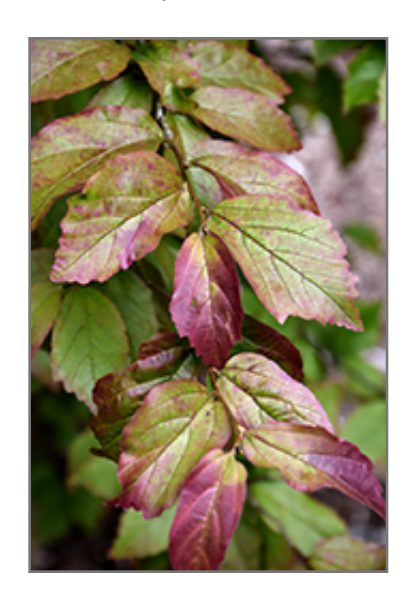
Persian Spire Parrotia foliage