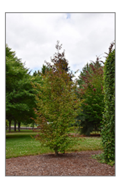
Persian Spire Parrotia