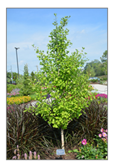
Goldspire Ginkgo