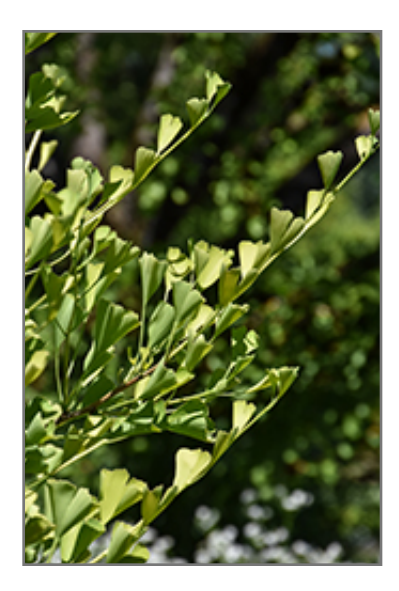
Goldspire Ginkgo foliage