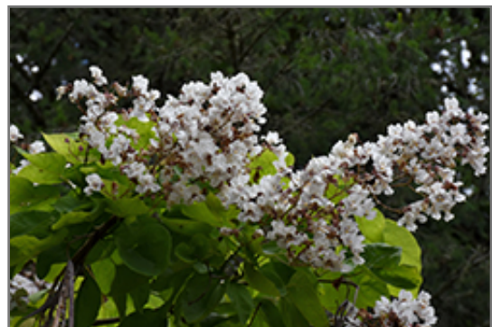
Heartland Catalpa flowers