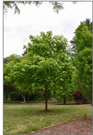
Heartland Catalpa