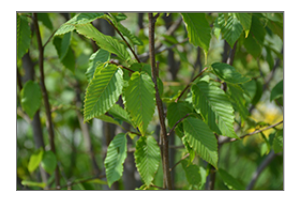
Palisade American Hornbeam foliage

This is a relatively low maintenance tree, and is best pruned in late winter once the threat of extreme cold has passed. Deer don't particularly care for this plant and will usually leave it alone in favor of tastier treats. It has no significant negative characteristics.