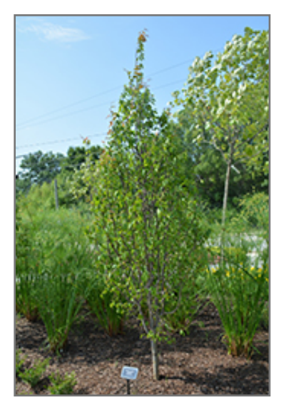
Palisade American Hornbeam

Palisade American Hornbeam is a deciduous tree with a shapely oval form. Its average texture blends into the landscape, but can be balanced by one or two finer or coarser trees or shrubs for an effective composition.