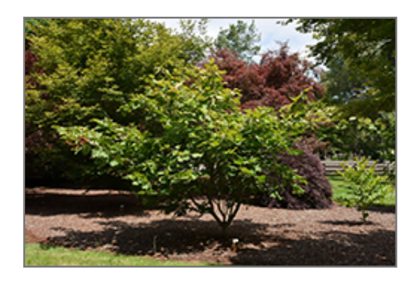
Ed Wood Fullmoon Maple