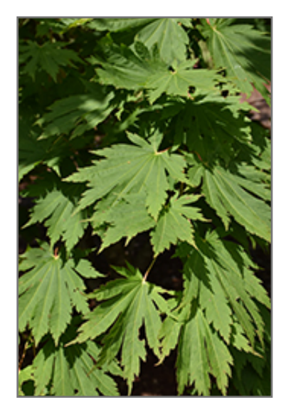
Ed Wood Fullmoon Maple foliage