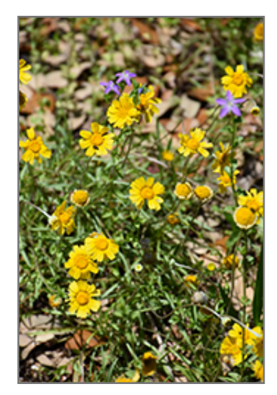
Four-nerve Daisy flowers