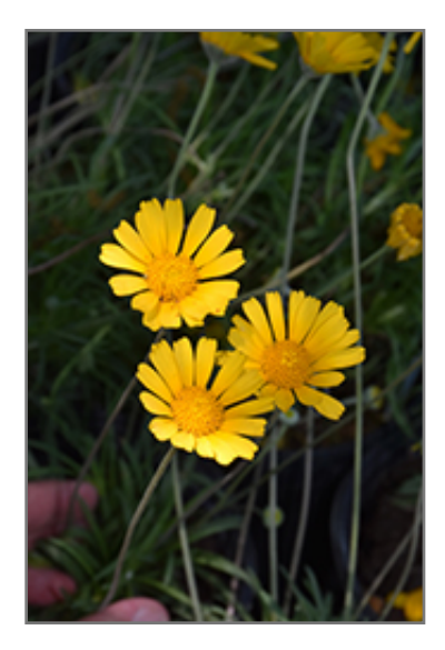
Four-nerve Daisy flowers

Four-nerve Daisy is recommended for the following landscape applications;