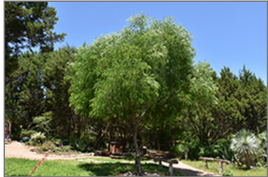
Eve's Necklace