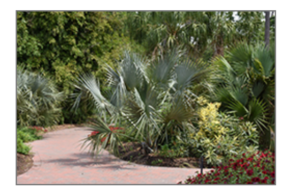
Sonoran Palmetto