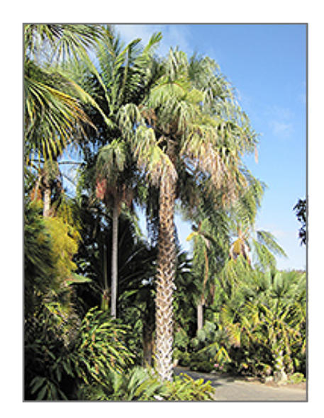
Sonoran Palmetto

This tropical plant does best in full sun to partial shade. It is very adaptable to both dry and moist locations, and should do just fine under average home landscape conditions. It is considered to be drought-tolerant, and thus makes an ideal choice for xeriscaping or the moisture-conserving landscape. It is not particular as to soil type or pH. It is highly tolerant of urban pollution and will even thrive in inner city environments. This species is not originally from North America.