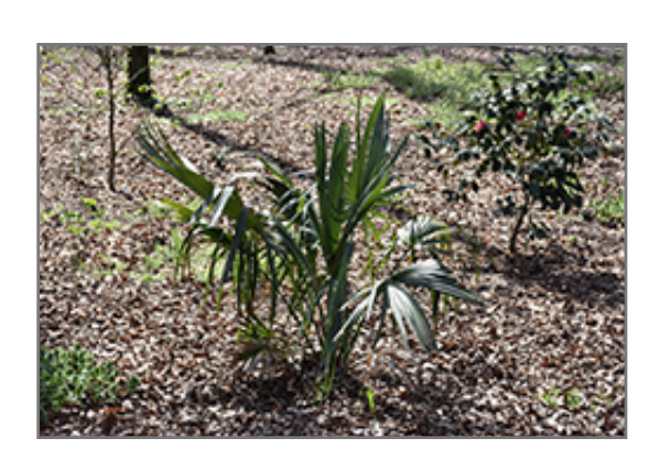
Brazoria Texas Palmetto Palm

This attractive variety is a naturally occurring hybrid that tolerates drought and adapts to a wide variety of soils; the most cold hardy of the Sable Palms; a stunning landscape accent