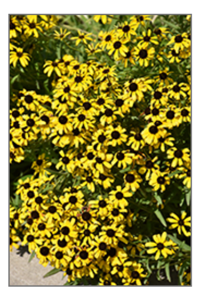
Missouri Coneflower flowers

This vigorous variety produces large, bright yellow daisies with dark brown, almost black eyes, over narrow green foliage; makes an outstanding cut flower; deadhead for re-blooming; drought tolerant once established; wonderful along borders