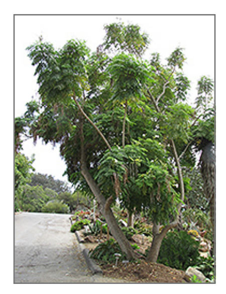
China Doll

This tropical plant does best in full sun to partial shade. It does best in average to evenly moist conditions, but will not tolerate standing water. It is not particular as to soil type or pH. It is highly tolerant of urban pollution and will even thrive in inner city environments. This species is not originally from North America..