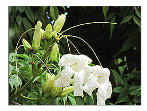
China Doll flowers