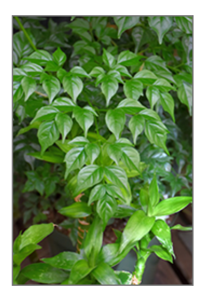
China Doll foliage

-- THIS IS A TROPICAL PLANT AND SHOULD NOT BE EXPECTED TO SURVIVE THE WINTER OUTDOORS IN OUR CLIMATE --