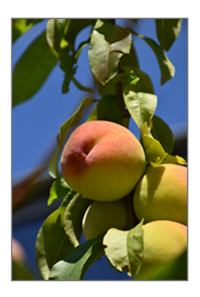
Sentinel Peach fruit

Sentinel Peach is smothered in stunning clusters of fragrant pink flowers along the branches in mid spring, which emerge from distinctive rose flower buds before the leaves. It has green deciduous foliage. The narrow leaves turn yellow in fall. The fruits are showy buttery yellow drupes with a scarlet blush, which are carried in abundance in mid summer. The fruit can be messy if allowed to drop on the lawn or walkways, and may require occasional clean-up.