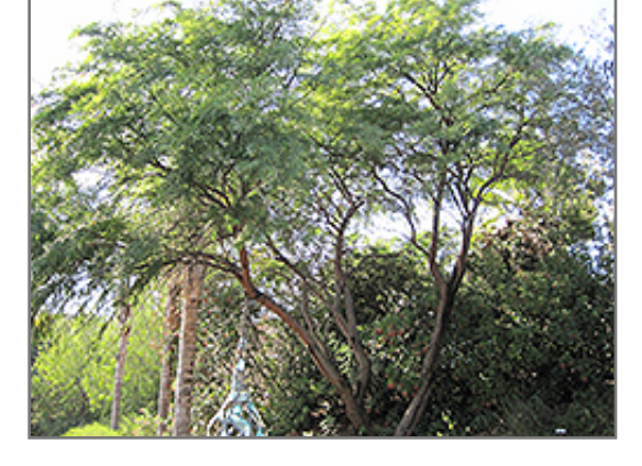
Western Honey Mesquite

Western Honey Mesquite is draped in stunning clusters of yellow catkins along the branches in mid spring. It has attractive light green deciduous foliage. The small narrow pinnately compound leaves are highly ornamental but do not develop any appreciable fall colour. The fruits are showy tan pods displayed from early summer to early fall.