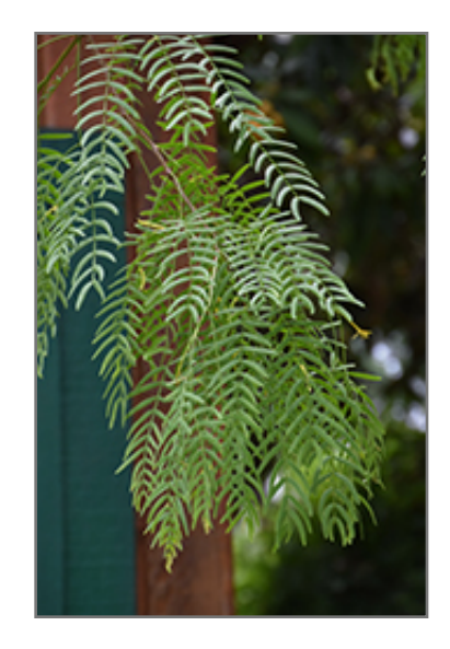
Maverick Thornless Texas Honey Mesquite foliage