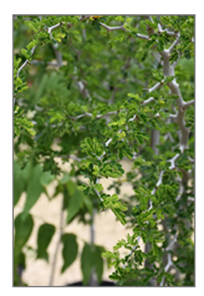
Texas Ebony foliage

This tree will require occasional maintenance and upkeep, and should only be pruned after flowering to avoid removing any of the current season's flowers. Gardeners should be aware of the following characteristic(s) that may warrant special consideration;