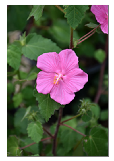
Rock Rose flowers

Rock Rose is recommended for the following landscape applications;