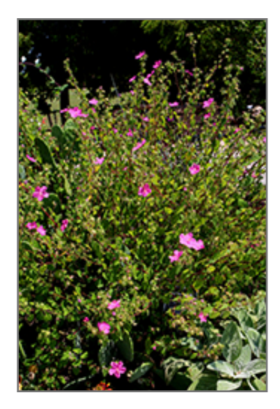
Rock Rose flowers