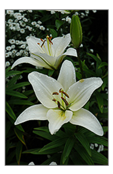
Navona Lily flowers

Navona Lily features bold white trumpet-shaped flowers with light green throats and brown anthers at the ends of the stems in early summer. The flowers are excellent for cutting. Its narrow leaves remain green in colour throughout the season.