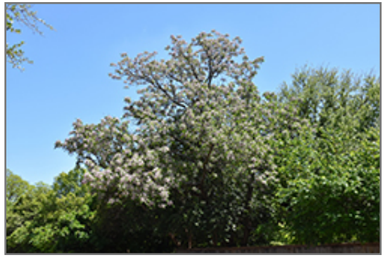
Chinaberry Tree in bloom