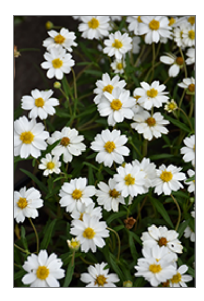
Blackfoot Daisy flowers

This is a relatively low maintenance plant, and is best cut back to the ground in late winter before active growth resumes. It is a good choice for attracting birds, bees and butterflies to your yard, but is not particularly attractive to deer who tend to leave it alone in favor of tastier treats. It has no significant negative characteristics.