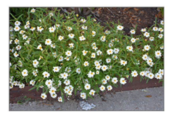
Blackfoot Daisy in bloom