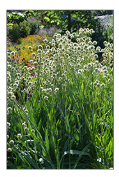
Rattlesnake Master in bloom