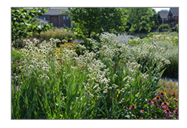
Rattlesnake Master in bloom

Rattlesnake Master will grow to be about 24 inches tall at maturity extending to 4 feet tall with the flowers, with a spread of 3 feet. Its foliage tends to remain dense right to the ground, not requiring facer plants in front. It grows at a medium rate, and under ideal conditions can be expected to live for approximately 10 years. As an herbaceous perennial, this plant will usually die back to the crown each winter, and will regrow from the base each spring. Be careful not to disturb the crown in late winter when it may not be readily seen!