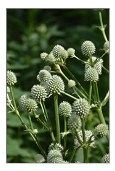
Rattlesnake Master flowers

Rattlesnake Master is an herbaceous perennial with a mounded form. Its relatively fine texture sets it apart from other garden plants with less refined foliage.