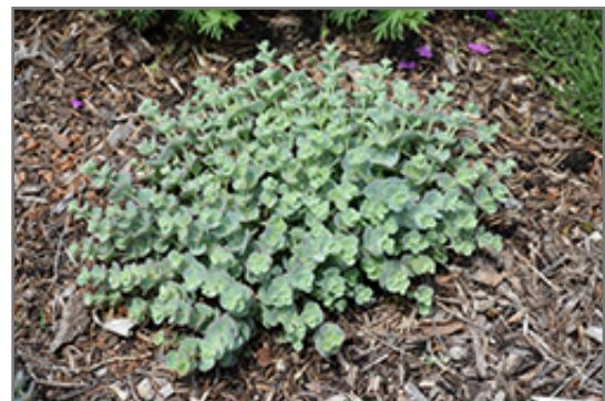
Dwarf October Daphne