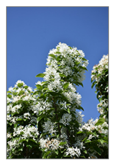
Tokyo Tower Chinese Fringetree flowers