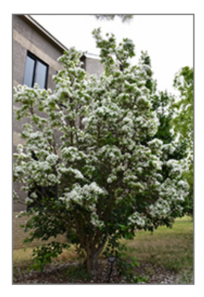
Tokyo Tower Chinese Fringetree in bloom

Tokyo Tower Chinese Fringetree is recommended for the following landscape applications;