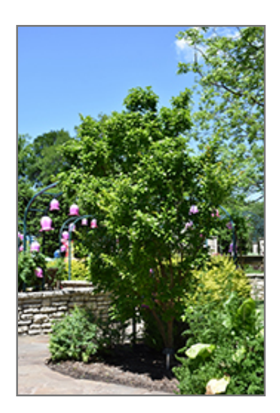
Tokyo Tower Chinese Fringetree

This tree does best in full sun to partial shade. It is quite adaptable, prefering to grow in average to wet conditions, and will even tolerate some standing water. It is not particular as to soil pH, but grows best in rich soils. It is highly tolerant of urban pollution and will even thrive in inner city environments. This is a selected variety of a species not originally from North America.